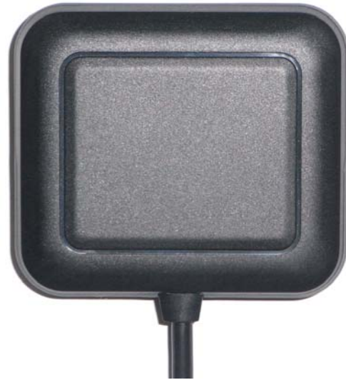
Figure 1:SGM5546-MTBDMU15 View