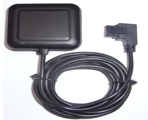
Figure 1:SRM5546-MTBD4MX20 View